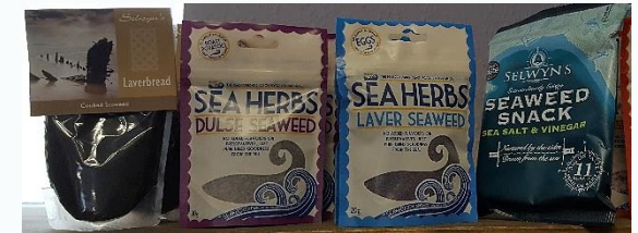
POPULAR WELSH SEAWEED SNACKS

Collection of some coastal species is well established in Wales and embedded in our culture. Did you know, Welsh Laver Bread and Conwy Mussels are now 'Protected European Food Names' recognised for their Welsh origin? However, there is very little documented evidence of the value of collection to the people of Wales.